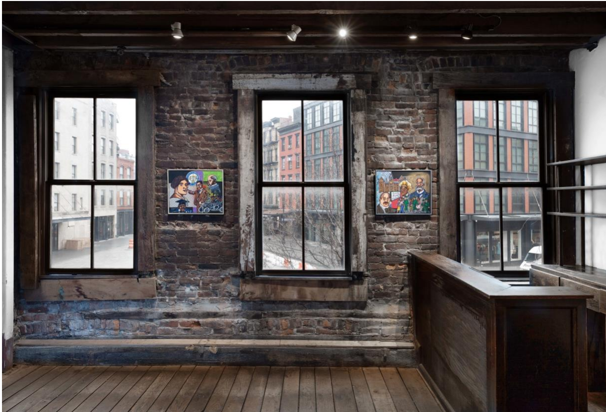
Installation view "Keith Duncan: The Big Easy," Fort Gansevoort, New York, N.Y. Shown, "Reconstruction Era" and "Black Inventors and Entrepreneurs Era."