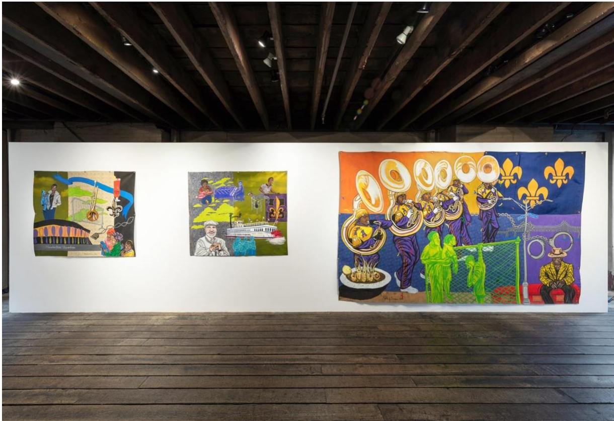
Installation view “Keith Duncan: The Big Easy,” Fort Gansevoort, New York, N.Y. Shown, From left, “Times Picayune #8,” “Times Picayune #7,” “Majestic Messengers.”

With illustrations by Willie Birch, “Roll With It: Brass Bands in the Streets of New Orleans” offers “a firsthand account of the precarious lives of brass band musicians in New Orleans. These young men are celebrated as cultural icons for upholding the proud traditions of the jazz funeral and the second line parade, yet they remain subject to the perils of poverty, racial marginalization, and urban violence...” Recently published, “Freedom’s Dance: Social Aid and Pleasure Clubs in New Orleans,” documents one of most prominent cultural traditions in New Orleans.