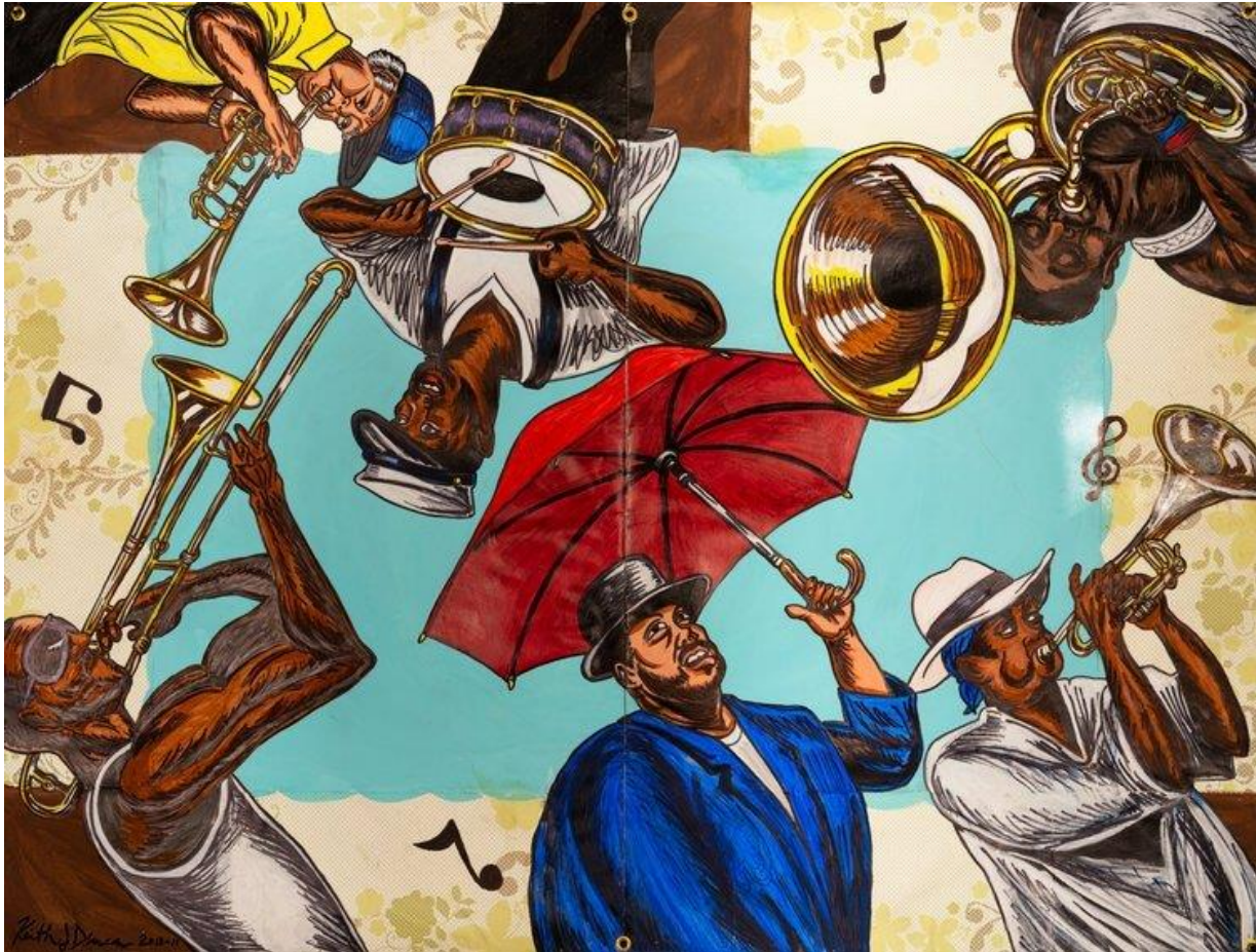
KEITH DUNCAN, "The Second Line #1," 2010-11 (acrylic on paper, 36 x 48).