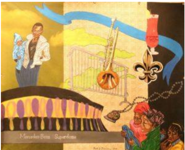
Times Picayune Series, 2013-16

Accordingly, another major inspiration of my works come from my Father; his real stories in folkloric manner has been a vital source of my new artworks. As a result, there is both a message in my art that can be "disturbing" to the viewer but yet allows invitation through my illustrative/ animated approach in my drawings and paintings. Furthermore, this is my focus, local sub-cultures and folk-cultures in