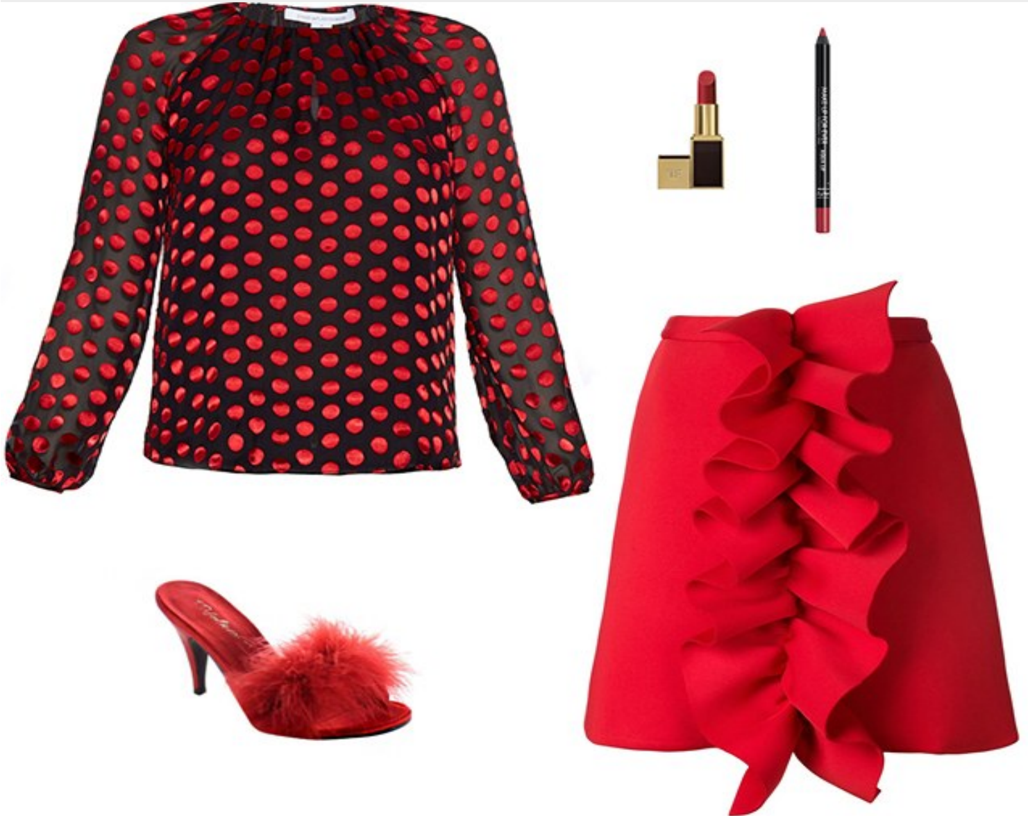
Diane von Furstenberg Marnie top