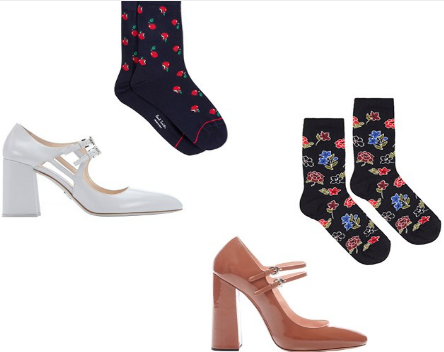
Prada light gray leather dual strap Mary Jane pumps