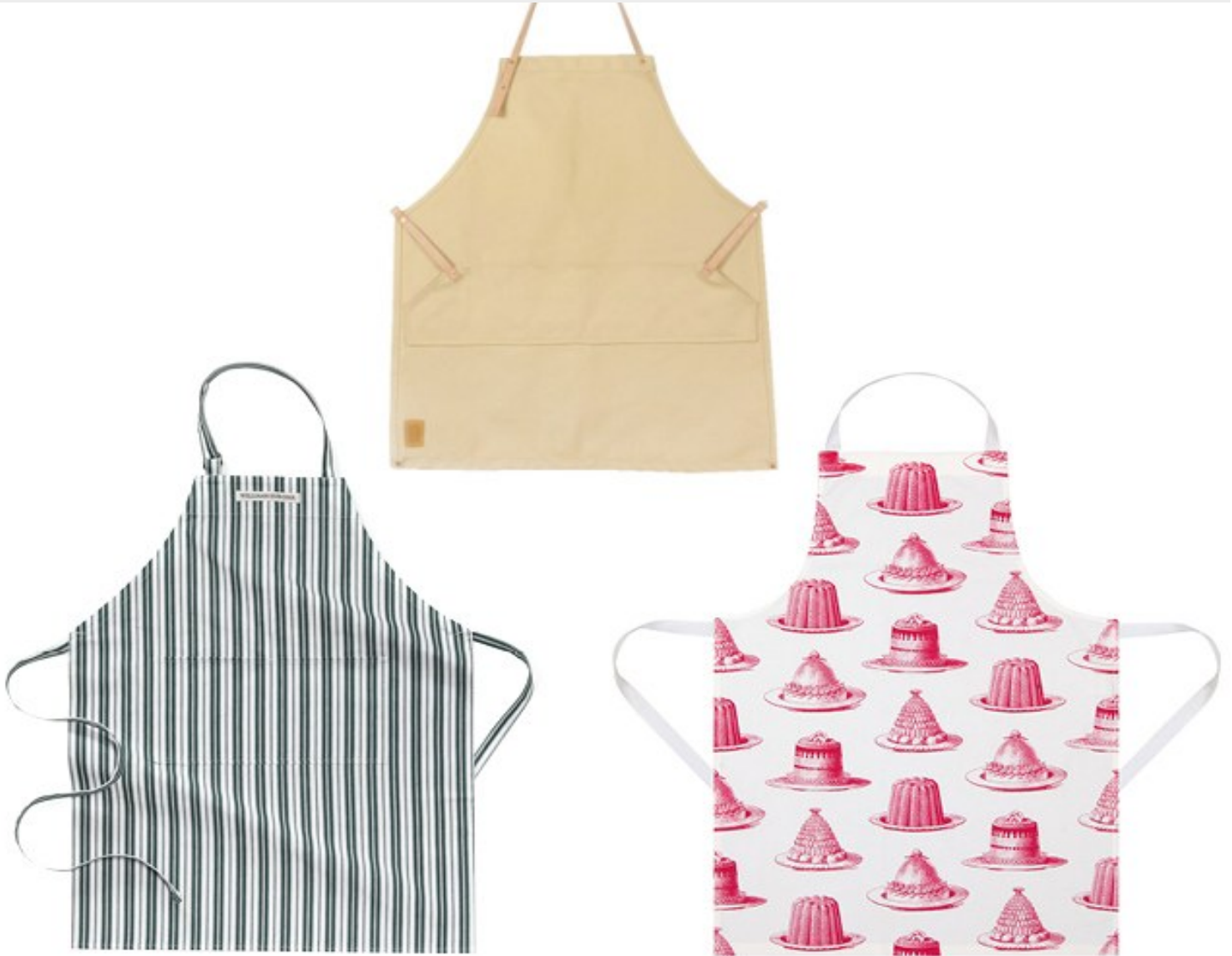
Williams-Sonoma personalized stripe apron