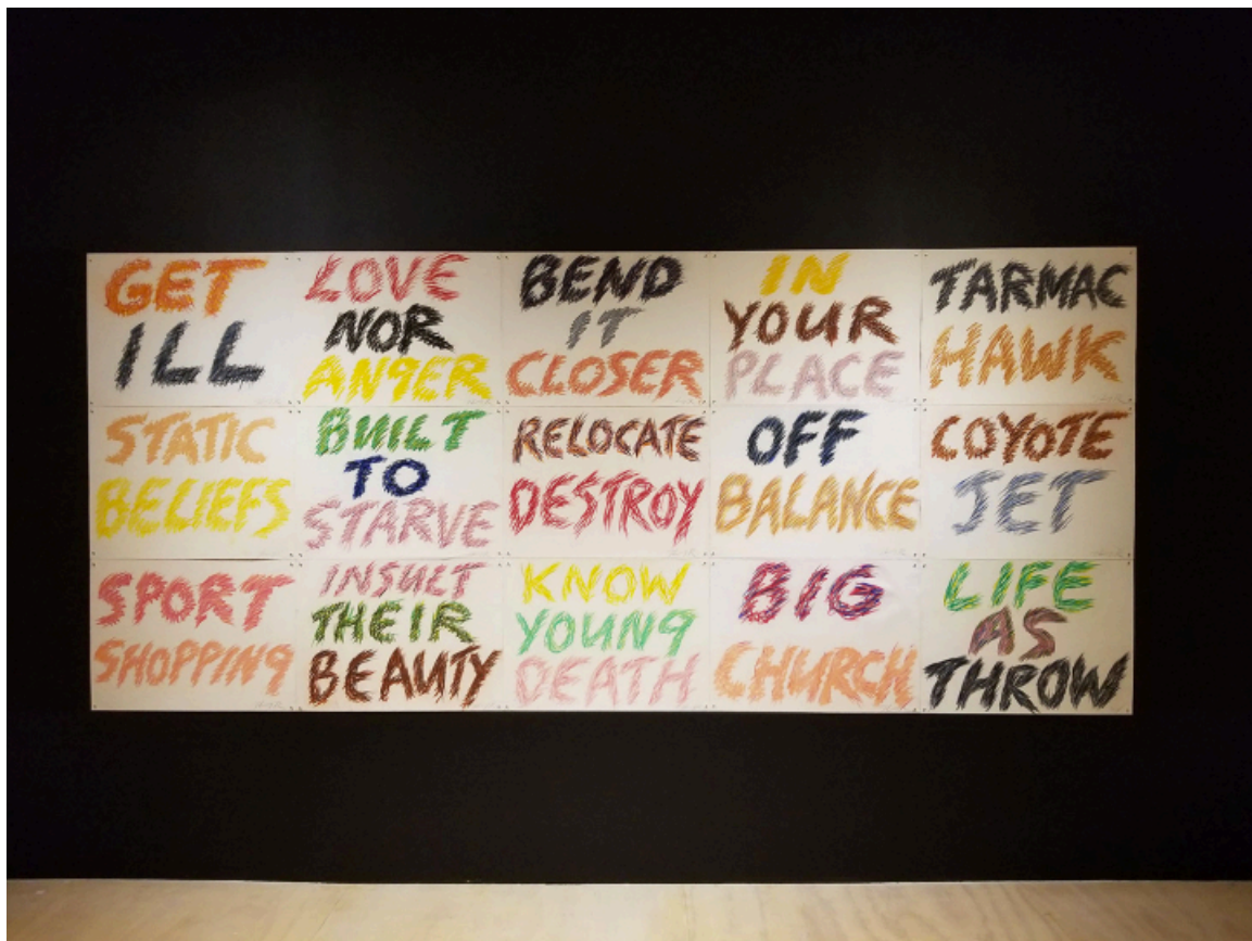
Edgar Heap of Birds, "American Policy II" (1987), pastel on rag paper, each: 22 × 30 inches, 90 × 150 inches

No one ever dealt with that violence historically. There's no Holocaust museum for Native people. We've lost 50 million Native people, but there's no remark about that anywhere in the government. Like any disfunction, if you don't deal with your disfunction at home, it just gets worse.