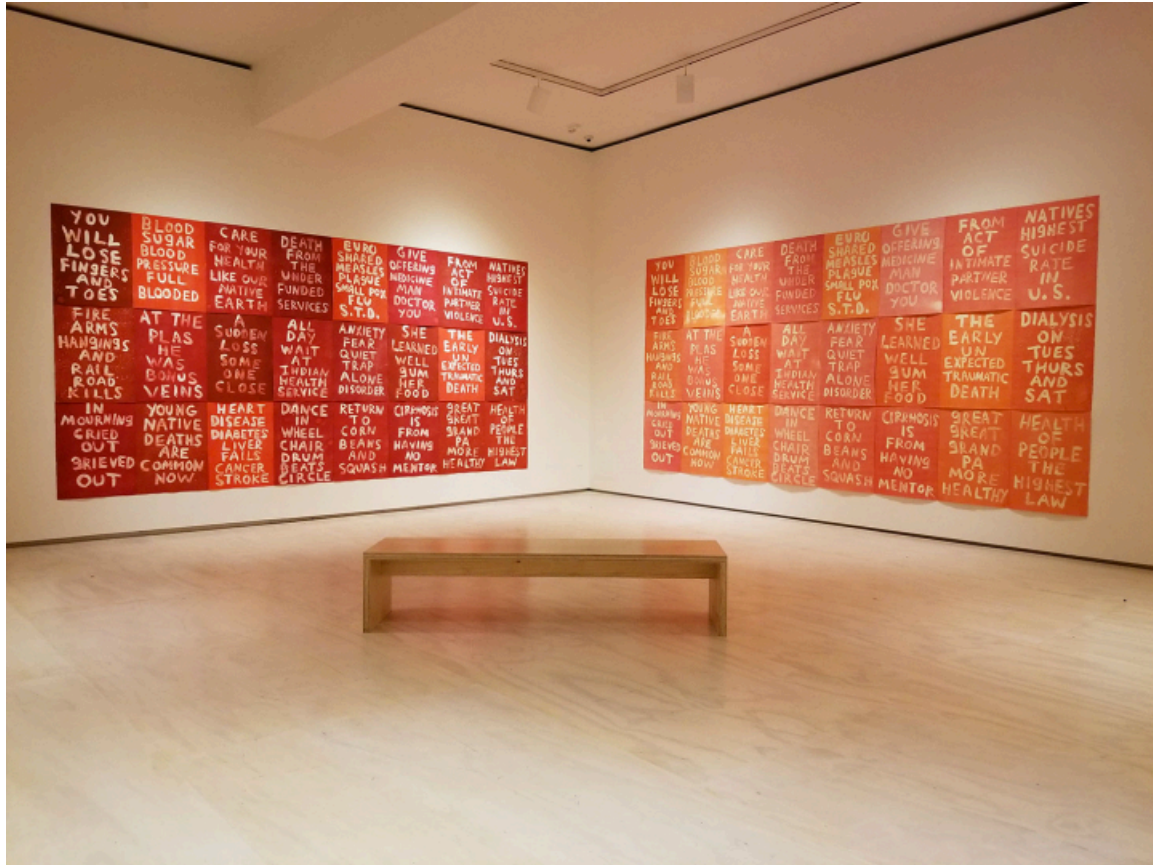
Edgar Heap of Birds, “Health of the People is the Highest Law” (2019), monoprints and ghost prints on creme rag paper, each: 30 × 22 inches, 90 × 352 inches

feeling for the lighter tinted piece. The ghost is the remnant of the murders — all the people that have come and gone and the ones that remain are represented by the ghost.