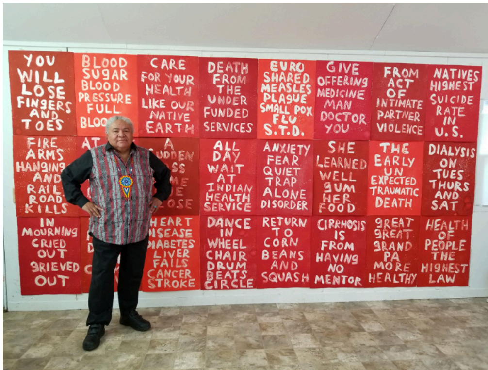
Edgar Heap of Birds with "Health of the People is the Highest Law" (2019)

In Hock E Aye Vi Edgar Heap of Birds: Surviving Active Shooter Custer, on view at MoMA PS1, the Cheyenne and Arapaho Nation artist, activist, and teacher makes the case that America's atrocities against Native people permeate into our culture today.