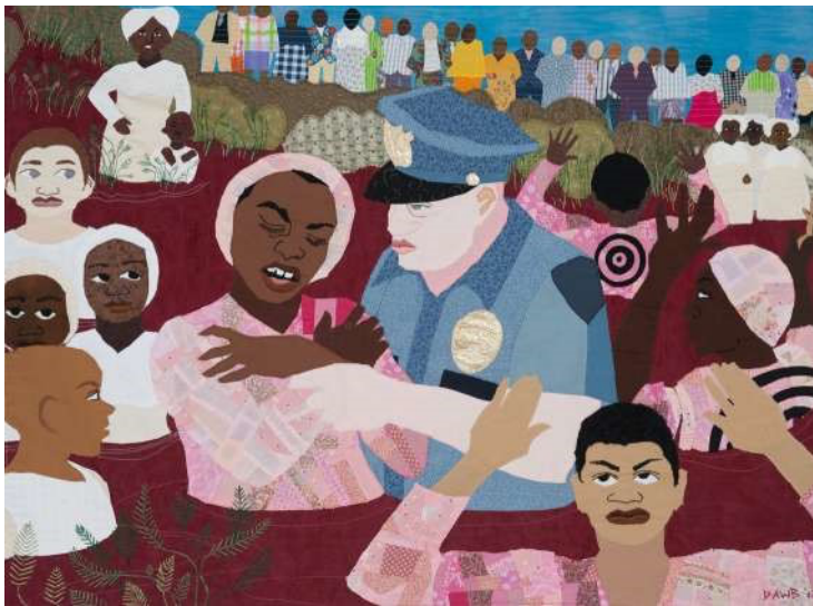
Dawn Williams Boyd, Baptizing Our Children in a River of Blood , 2017.

The Safety Patrol shows a unified group of young Black girls shielded by a central figure. The figures appear otherworldly, saturated in lush reds and pinks; floral-printed and -textured fabrics add depth to the composition. “I use West African wax printed fabric, kente cloth and Dutch wax prints to communicate that my figures are of African descent and have a long, rich history behind them,” Butler said in a recent interview for Smithsonian magazine. “I choose bright technicolor cloth to represent our skin, because these colors are how African Americans refer to our complexions.”