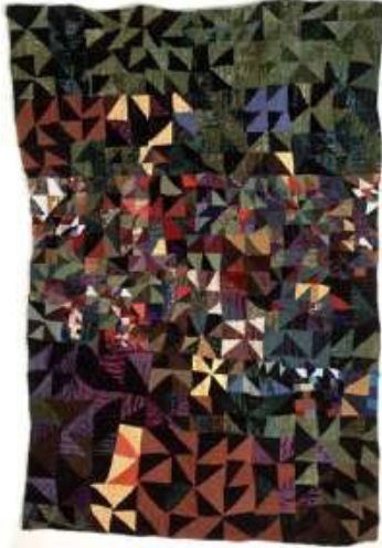
Rosie Lee Tompkins Untitled, 1987 "Architecture of Life" at UC Berkeley Art Museum and Pacific Film Archive, Berkeley