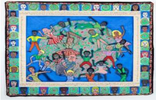
Faith Ringgold Ancestor's Part II, 2017 Goodman Gallery Contact for price