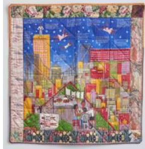
Faith Ringgold Tar Beach 2, 1990 Goodman Gallery Contact for price

“If you look at African American quilts, they’re basically a kind of pieced quilt too, but for the most part they don’t become geometric. That’s based on an African idea of textiles,” Dawson said in the PBS documentary Craft in America: QUILTS (2019). “The use of the narrative is using the quilt as a storyteller. That’s also an important African element. The whole idea of celebrating the culture that came out of the slave ships.”