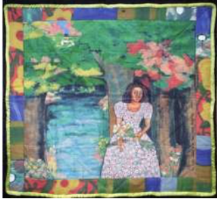
Faith Ringgold Listen to the Trees, 2012 The Brodsky Center at PAFA $12,000