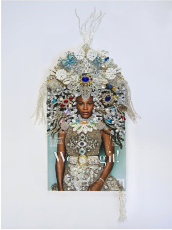
VANESSA GERMAN, "Serena as Black Madonna #1," 2015 (mixed-media collage on Vogue magazine, 21 x 16 x 1 1/2 inches).