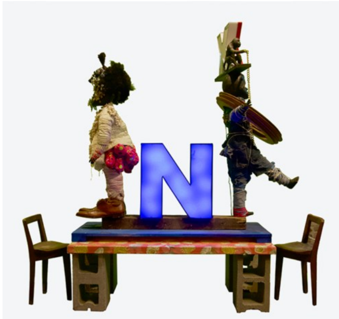
VANESSA GERMAN, "For Black Boys Who've Considered Suicide Body Soul Space Between," 2019 (mixed-media assemblage, 72 x 73 x 24 inches).

Presented in association with Pavel Zoubok Fine Art, "Vanessa German, TRAMPOLINE: Resilience & Black Body & Soul" is on view at Fort Gansevoort in New York City, Nov. 7-Dec. 21, 2019