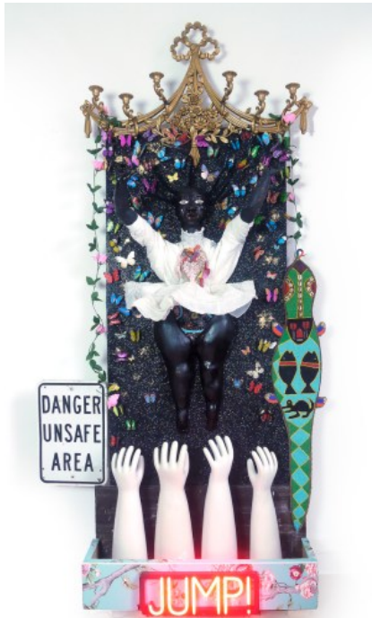
VANESSA GERMAN, "You Will Have to do Your Best to Fly Away From Them Hands That Come to Take You Outta Your Own Soul," 2019 (mixed media assemblage, 96 x 48 x 14.5 inches).