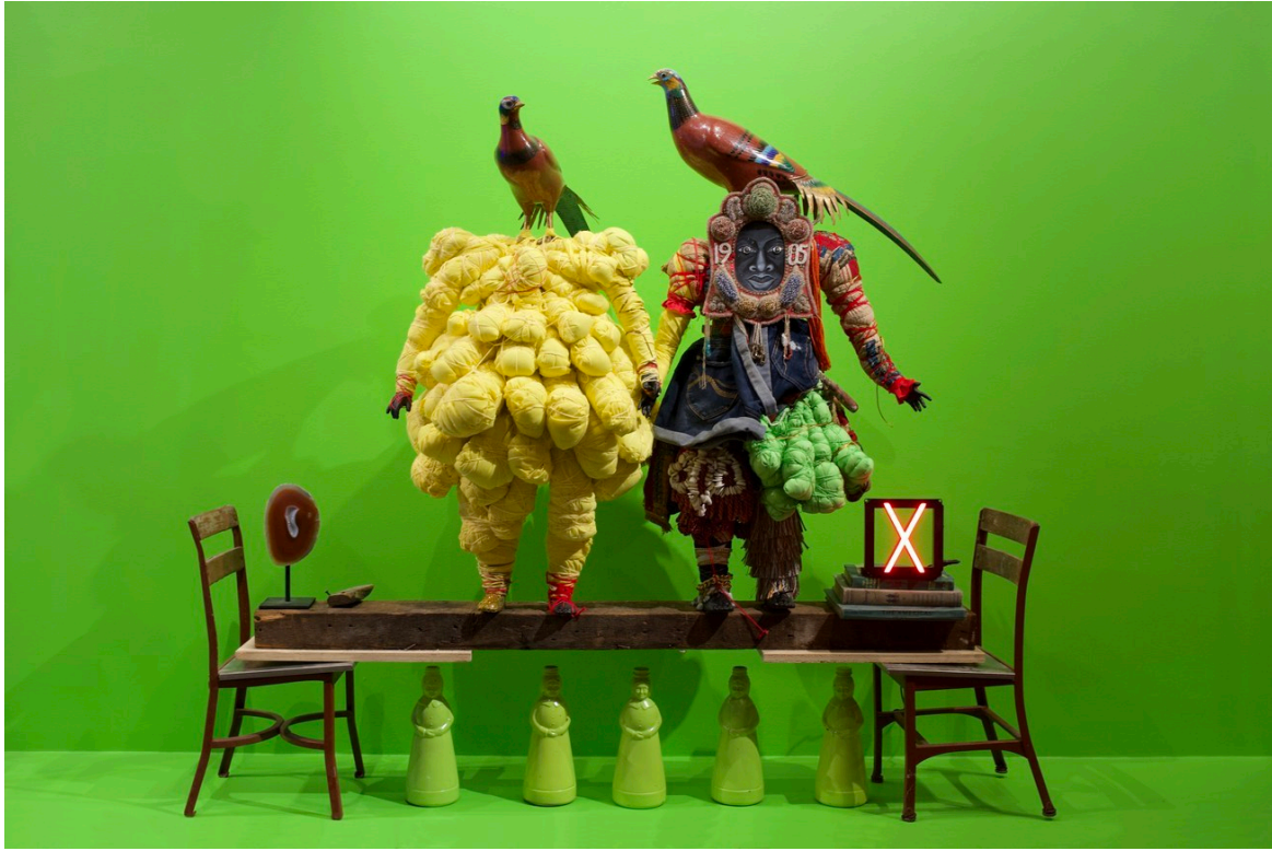
VANESSA GERMAN, "Can I Love You Without Capitalism? How?" 2019 (mixed-media assemblage, 59 x 67 1/2 x 26 inches).