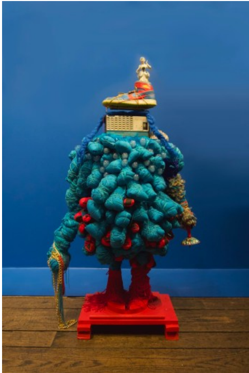
VANESSA GERMAN, "Hyper Sensitive Feeling Machine Body.Soul.Emotion. Volume Control," 2019 (mixed-media assemblage, 55 x 30 x 17 inches).