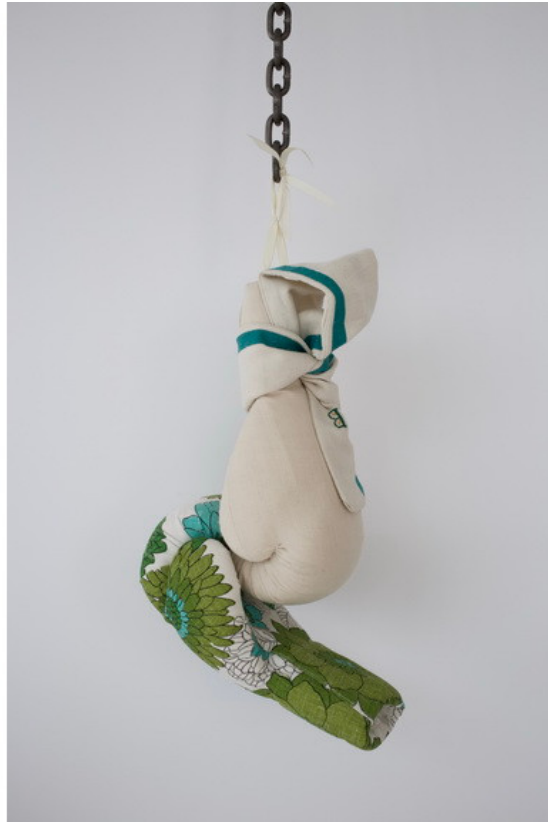
Left: Zoë Buckman – Fool, 2018. Embroidery on vintage linen tea towel, 24 1/4 x 16 inches. Framed 27 1/2 x 19 1/4 inches / Right: Zoë Buckman – For B, 2018. 2 boxing gloves, vintage linen, chain, 21 x 10 1/2 x 7 1/2 inches