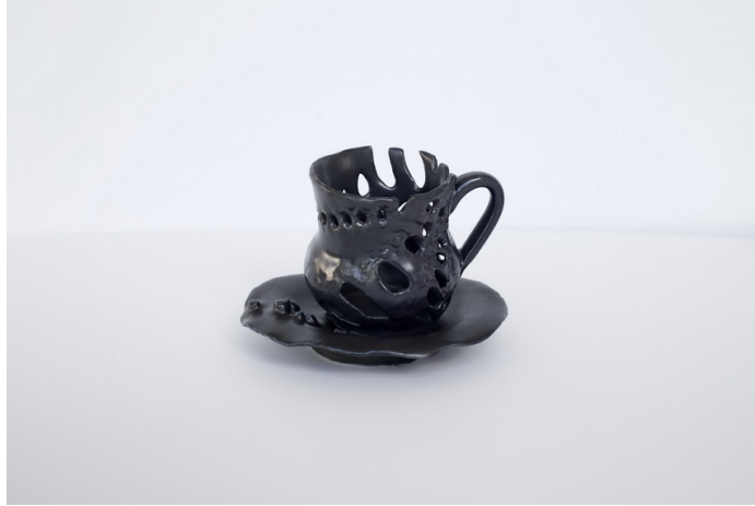
Zoë Buckman – Anything Blue, 2019. Porcelain, 3 1/4 x 4 3/4 x 4 3/4 inches