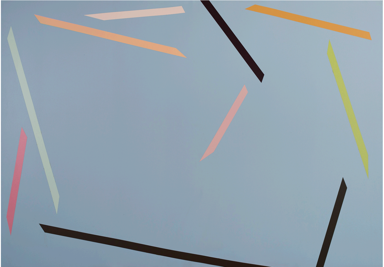
Alan Cote Untitled; 1972 Acrylic on Canvas 78 x 112 inches