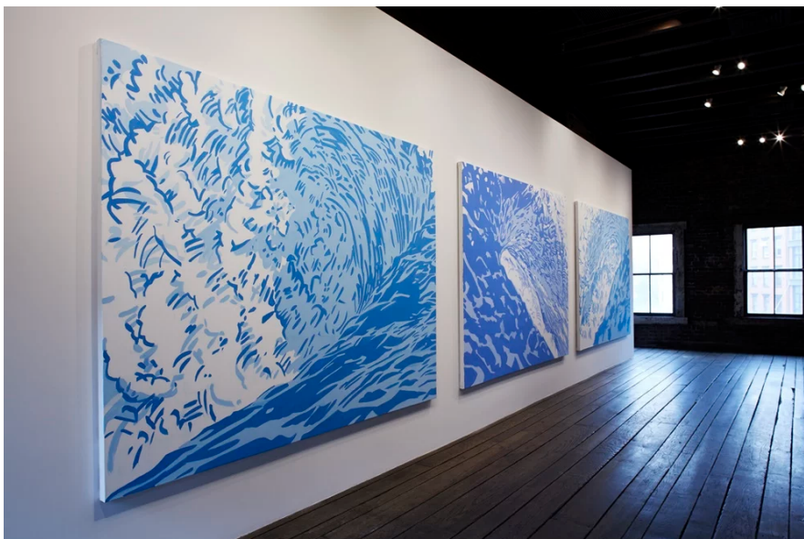
Installation view of Roy Fowler, “New Wave” at Fort Gansevoort Gallery.