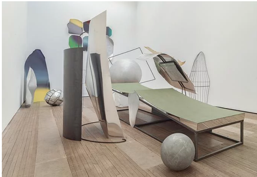
Liu Wei, Transparent Land (2016). Courtesy of Lehmann Maupin.

artnet News ( https://news.artnet.com/about/artnet-news-39 ), November 21, 2016