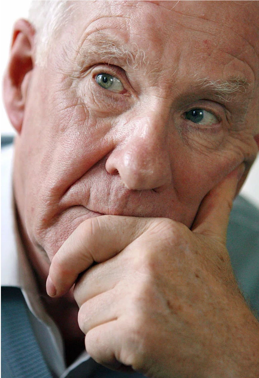
Alain Badiou in 2008.

2. "Inventing the Future: Postcapitalism and a World Without Work ( http://www.miquelabreugallery.com/pdf/InventingTheFuture_November2016_PR.pdf ) at Miquel Abreu Gallery ( http://www.miquelabreugallery.com/ )