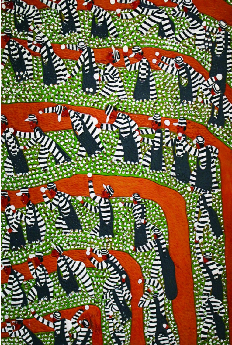
"Chain Gang Picking Cotton #2," dye on carved and tooled leather, 2004.