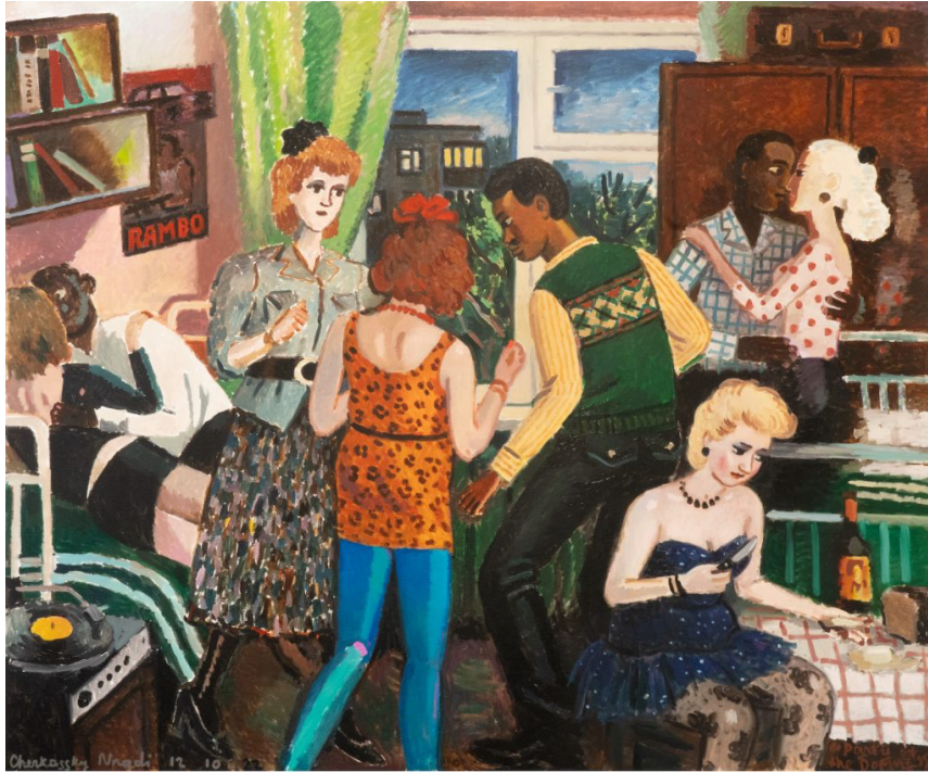
Zoya Cherkassky, Party at the Dorms (2022).