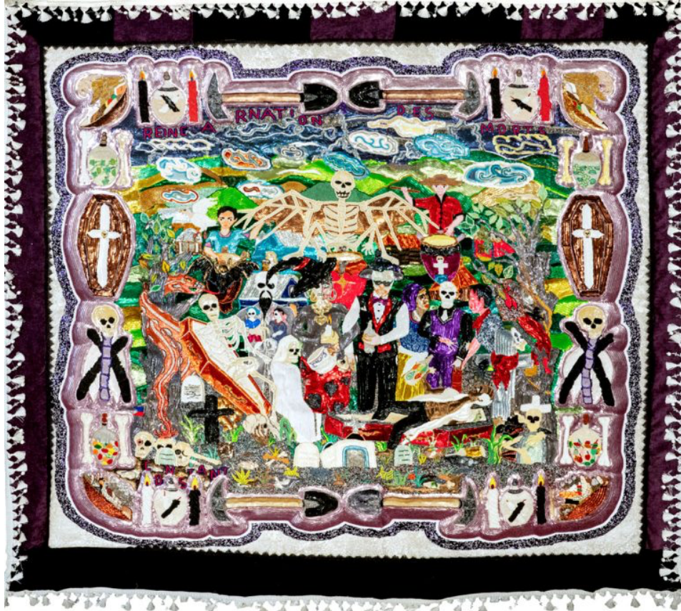
Reincarnation Des Morts 110 x 111 inches. Beads, sequins, tassels on fabric. 2022.

Fort Gansevoort Gallery in New York's Meatpacking District has long been one of my favorite galleries. Housed in an old three-story building, they have been presenting some of the freshest and most original shows in the city. The current exhibition, Myrlande Constant: Drapo is one of their best. Constant is a Haitian artist who works in textiles, taking a traditional form called "drapo" and rocketing it into the realm of contemporary art. Drapo is based on a 19th century embroidery technique developed in France, called tambour. Fabric is stretched tautly over a wooden frame and embroidery, using sequins and beads done from the reverse side.