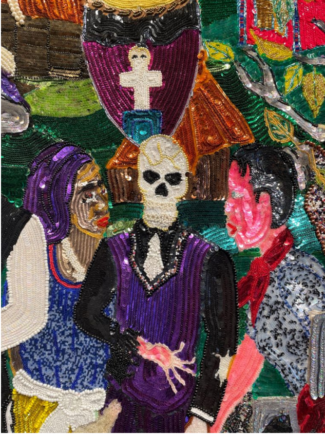
Reincarnation Des Morts, detail, 110 x 111 inches. Beads, sequins, tassels on fabric. 2022

I love the way that Constant embroiders the landscape and sky behind the figures. The picture plane is flat, moving us from below the earth to the sky. Nothing is static in this piece. The dynamic swirl of the lives of the spirits is reflected in the dynamism of the textile. The work has an affinity to painting that is unusual in this field. Vodou banners were traditionally made by men and typically more static in their portrayal of the world. Constant brings both a mastery of the craft and a mastery of composition to this body of work.