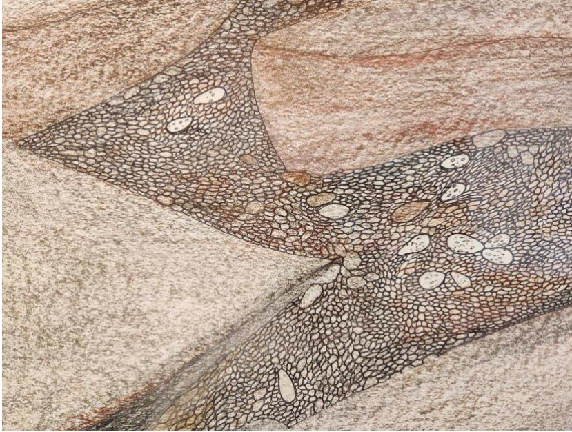
Detail of Shuvinai Ashoona's "Eggs and Rocks" (2023), a colored pencil and ink drawing on paper showing a rocky landscape populated by native birds

Spread across three gallery floors, Ashoona's compositions celebrate and document contemporary Inuit existence and perseverance in juxtaposition with pre-colonial traditions that have been threatened by the modern environmental consequences of capitalism and colonialism. These explosions of color and carefully mapped spatial dynamics narrate the artist's enthusiasm for life and its truths, in all their harshness and beauty.