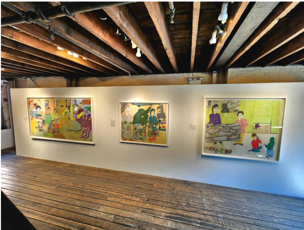
Installation view of Shuvinai Ashoona's enormous drawings on the second floor at Fort Gansevoort