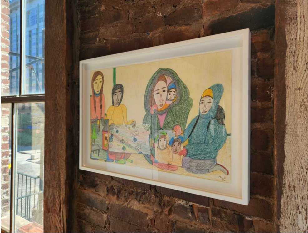
An installation view of Shuvinai Ashoona's "Untitled" (2023), ink and colored pencil on paper, 15 x 23 inches, on the second floor at Fort Gansevoort