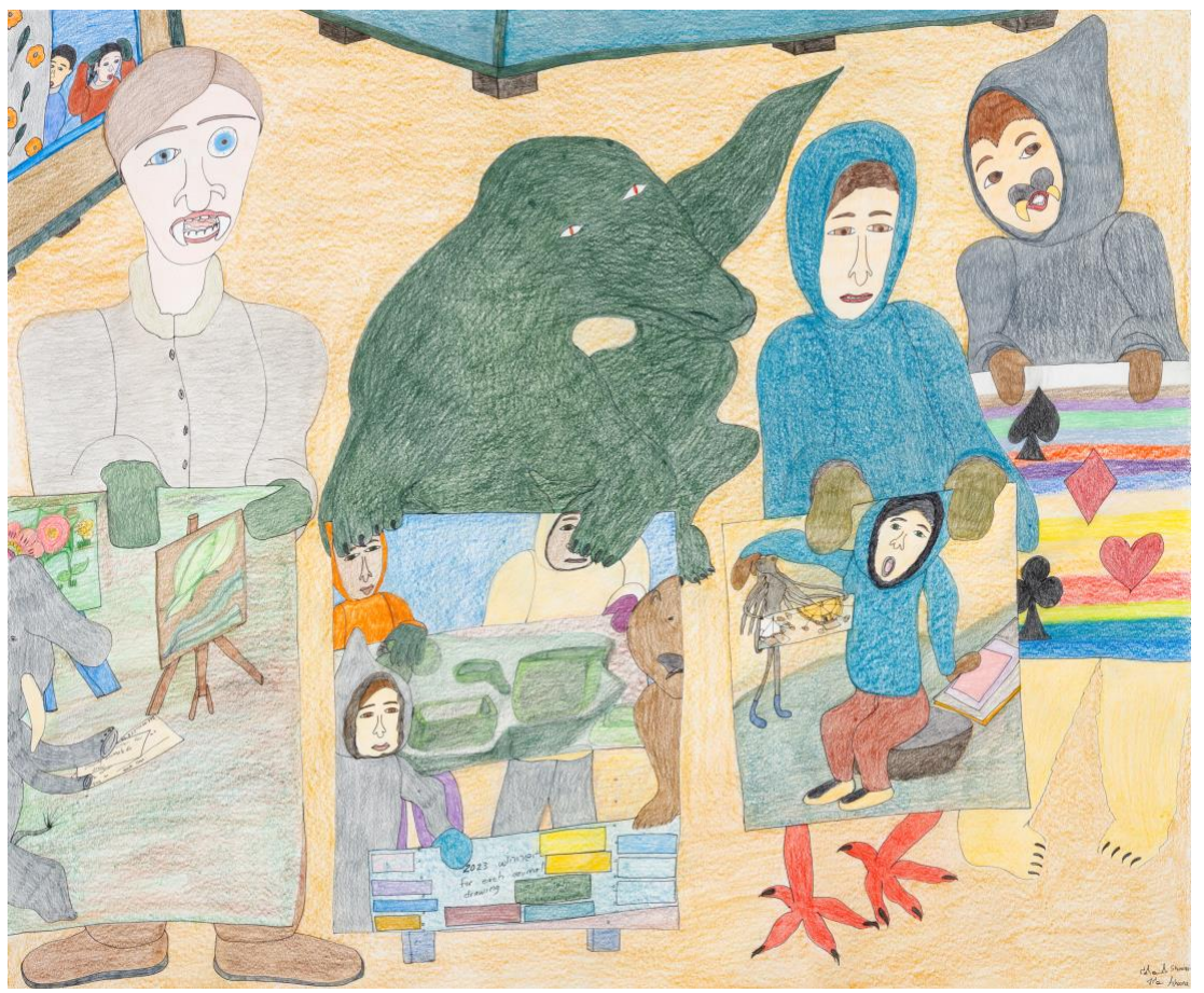
"Drawing like the elephant," 2023, Colored pencil and ink on paper. 41.5 x 50.25 in. © Shuvinai Ashoona, courtesy of Fort Gansevoort, New York.

The oldest of 14 children, Shuvinai Ashoona takes inspiration from Inuit mythology and the wildlife of her ice-scape home. As her show comes to Britain, the artist looks back.