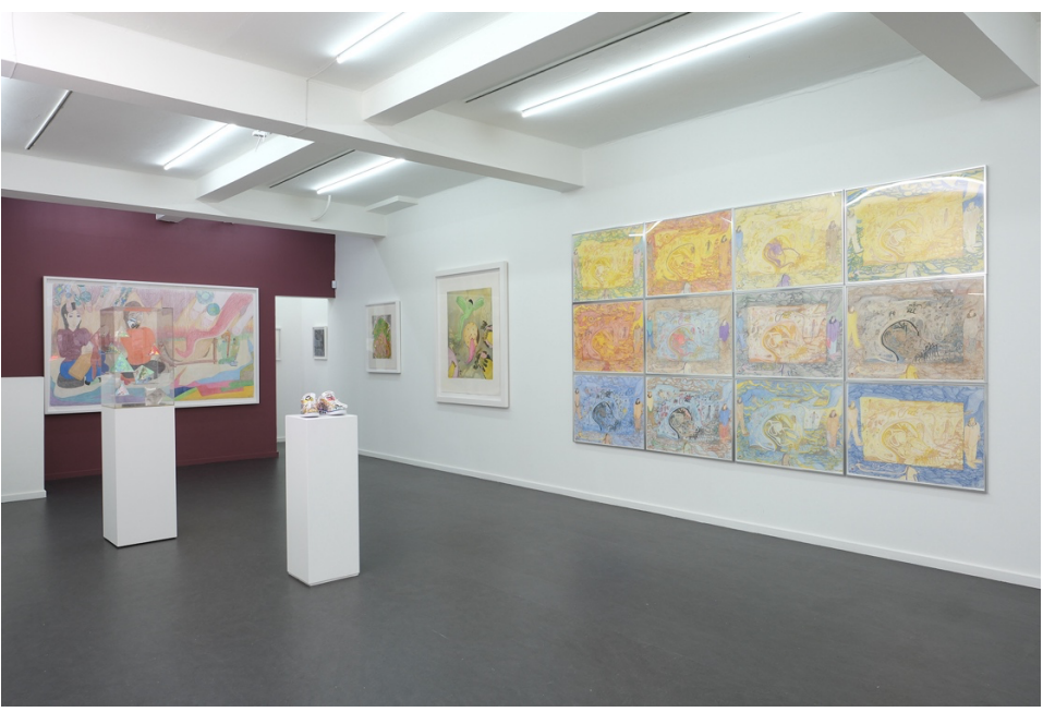
Shuvinai Ashoona: An Exhibition and Celebration, Marion Scott Gallery, installation view

present-day elements through drawings. A few works are self-portraits, while many are detailed fantastical landscapes peppered with human figures with animalistic features.