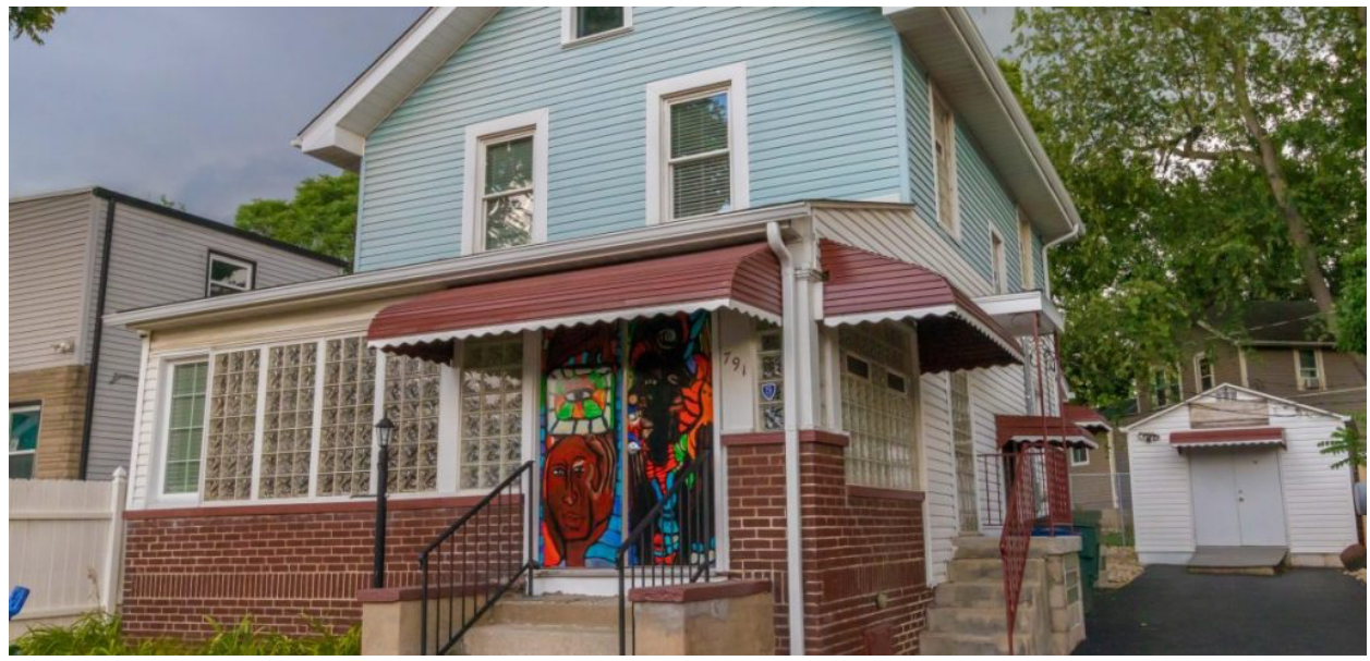
The Aminah Robinson Artist Residency.