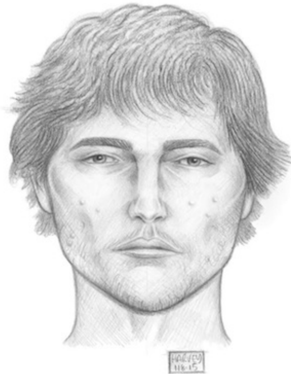
A Sketch for the NYPD by Jason Harvey of a Suspect in a 2015 hate crime in Williamsburg

The process of creating a composite illustration relies on a witness's descriptions of the suspect. At the precinct, the detective asks the witness simple, open-ended questions about the suspect's face, avoiding leading questions. Then, they have the witness look at photographs of people and pick out features that remind them of the suspect's. After drawing a composite illustration based on these descriptions, the sketch artist asks the witness to make adjustments as they see fit. "They'll say, 'oh, the eyes are bigger, the nose is wider, the lips are thinner, the shape of the head is wrong,'" Harvey explains. "We'll make those adjustments to get it as close as we possibly can."