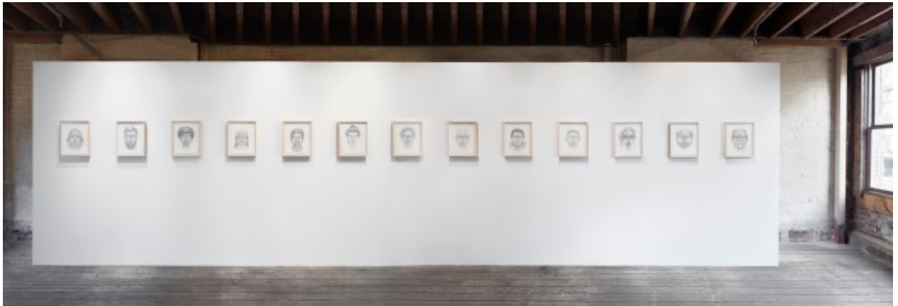
"Fantasy Composites" at Fort Gansevoort Gallery